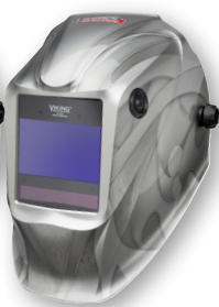
Heavy Metal® K3029-4