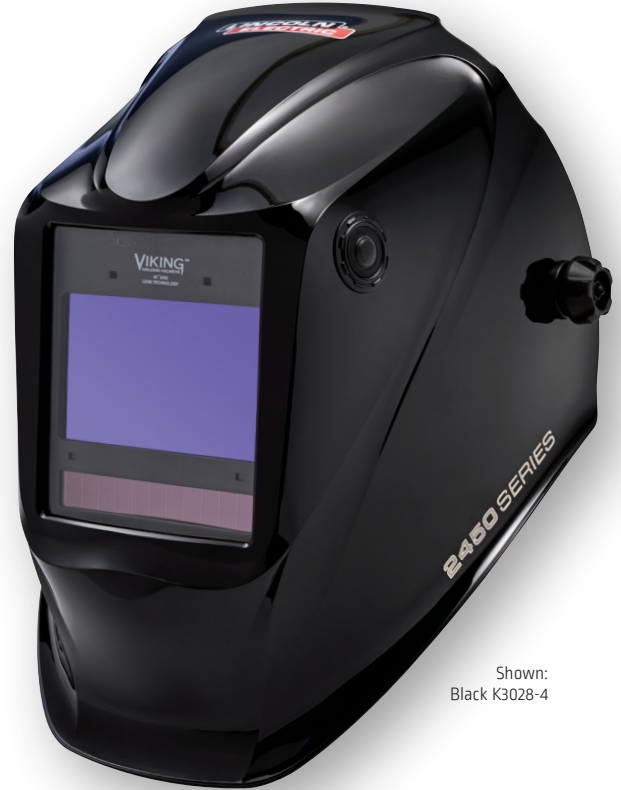
Shown: Black K3028-4