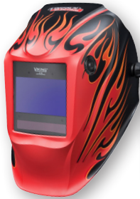
Street Rod® K3035-4