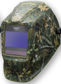
White Tail Camo™ K4411-4