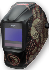
Graveyard Shift® K3099-4