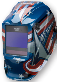
All American® K3174-4