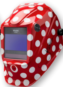
Jessi the Welder™ K4437-4